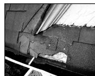
Animal damaged asphalt shingles