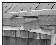
Cedar roofing needs restoration