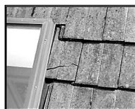
Broken or improperly installed tiles

Whether your roof needs a simple repair, restoration, or replacement, we will give you an honest assessment. Our roofing department has the experience needed to help you get the job done right.